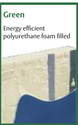
Strong Steel stiffened